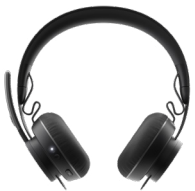
ZONE WIRELESS PLUS