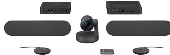
RALLY & RALLY PLUS Part # 960-001217 Plus Part #: 960-001225